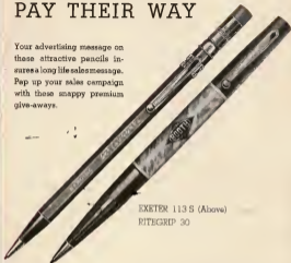
EXETER 113 S (Above)

Your advertising message on these attractive pencils insures a long life sales message. Pep up your sales campaign with these snappy premium give-aways.